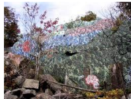
Skull Rock – a fun, offbeat trail site!

We hope you enjoy your visit to Bow Ridge/Kallenberg Quarry. As with all our conservation properties, for your comfort and safety, activities are allowed from Dawn to Dusk. Please observe all signage as posted. Thank you!