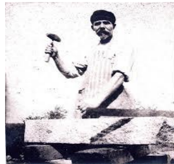
A quarry worker shapes a structure.

Kallenberg Quarry was purchased by the Conservation Commission in 1964. In 1847 blocks of granite were dragged to Boston on stone boats (platforms without wheels) to erect Boston’s U.S. Customs House. Granite structures can be seen throughout Lynnfield – in Forest Hill Cemetery, Tapley’s Tomb and on the Lynnfield Common.