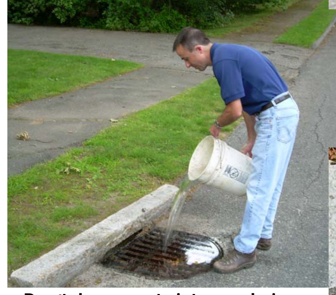
Don't dump waste into our drains.

Heavy use of fertilizers can promote algae growth in our wetlands and waterways and damage wildlife.