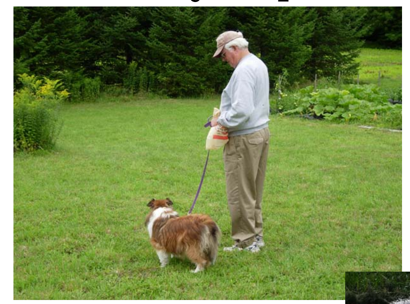
Bag all pet waste and dispose in the trash.

Pet waste can contaminate our waterways when not properly disposed of.