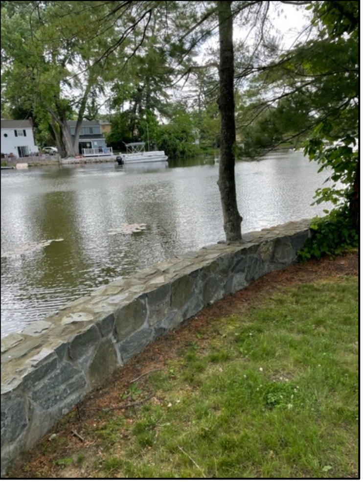
Photo 2: Area of wall required to be removed to save tree. Recommend additional buffer zone plantings in this area (6.17.22).

Photo 1 : 2-foot area of patio to be removed and planted against retaining wall (6.17.22).