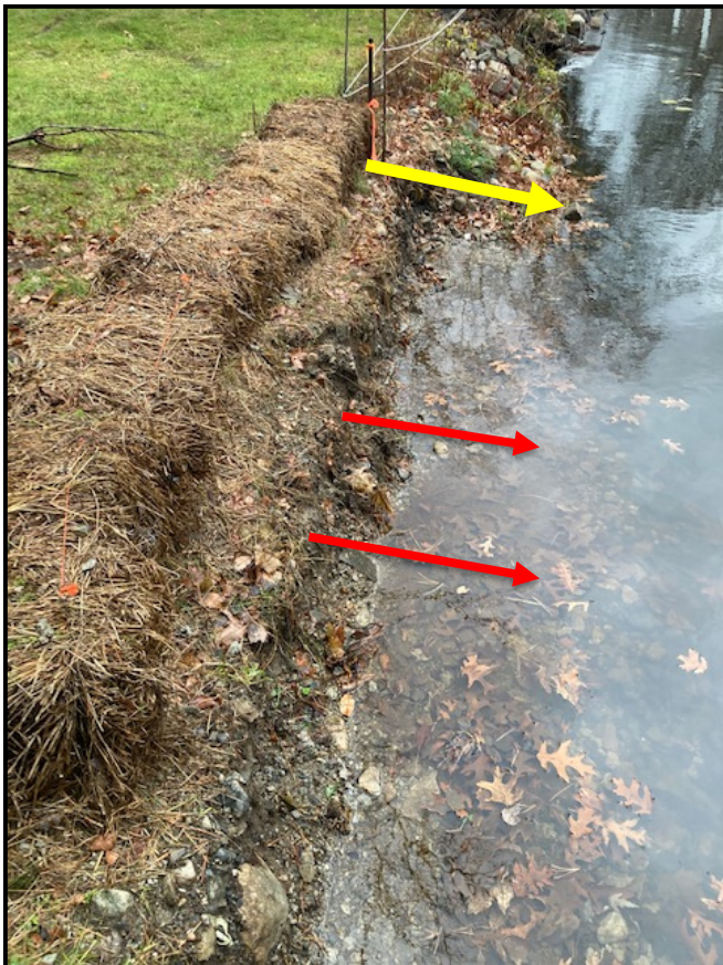
Photo 5 : Yellow arrow indicates original Bank toe of slope. Red lines indicate approximate newly proposed toe of slope of restored bank .