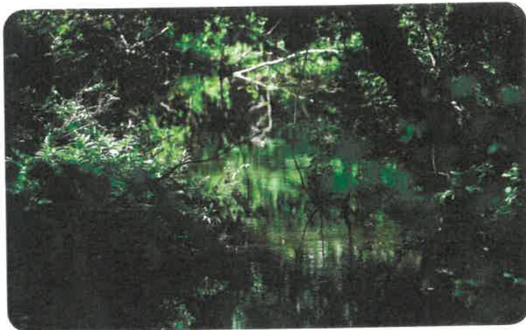
Water flows through Beaver Dam Brook Reservation.