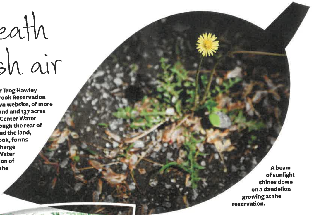
A beam of sunlight shines down on a dandelion growing at the reservation.