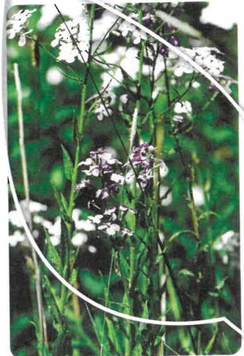
Wildflowers bloom at the reservation.