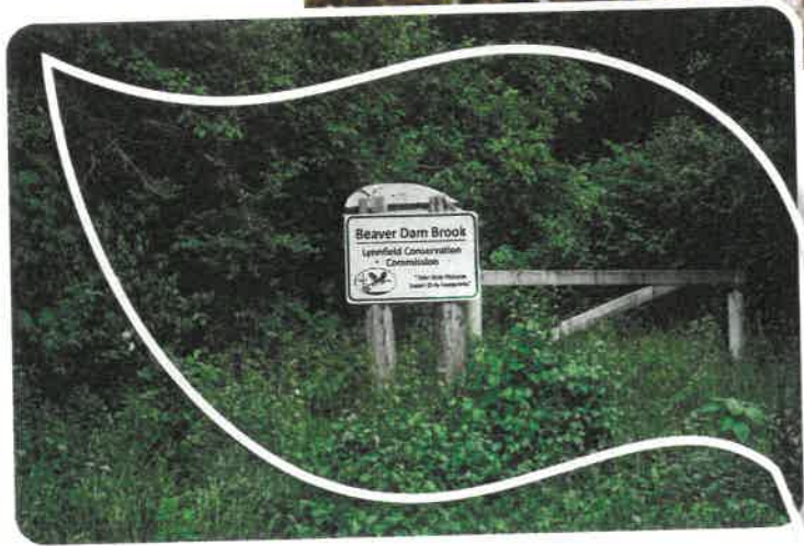
Beaver Dam Brook Reservation is one of the Lynnfield Conservation Commission's nine conservation areas.