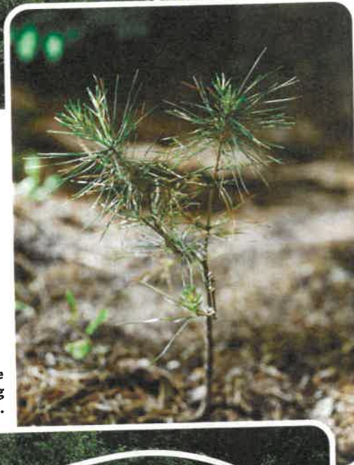
A pine seedling grows.