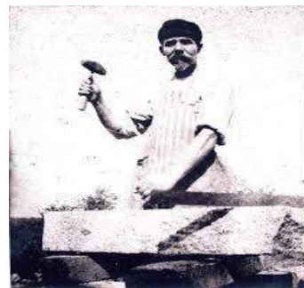
A quarry worker shapes a structure.

Kallenberg Quarry was purchased by the Conservation Commission in 1964. In 1847 blocks of granite were dragged to Boston on stone boats (platforms without wheels) to erect Boston’s U.S. Customs House. Granite structures can be seen throughout Lynnfield – in Forest Hill Cemetery, Tapley’s Tomb and on the Lynnfield Common.