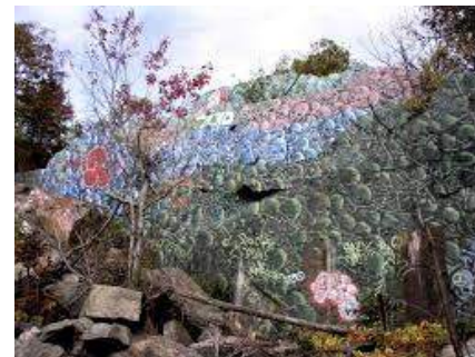
Skull Rock – a fun, offbeat trail site!

We hope you enjoy your visit to Bow Ridge/Kallenberg Quarry. As with all our conservation properties, for your comfort and safety, activities are allowed from Dawn to Dusk. Please observe all signage as posted. Thank you!