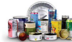
Food and Beverage Cans empty and rinse