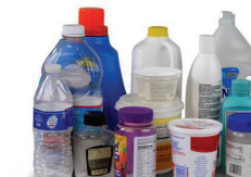
Bottles, Jars, Jugs and Tubs empty and replace cap