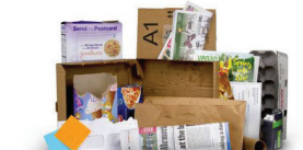
Mixed Paper, Newspaper, Magazines, Boxes empty and flatten