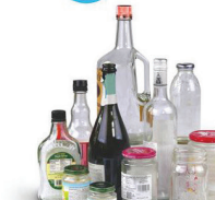
Bottles and Jars empty and rinse